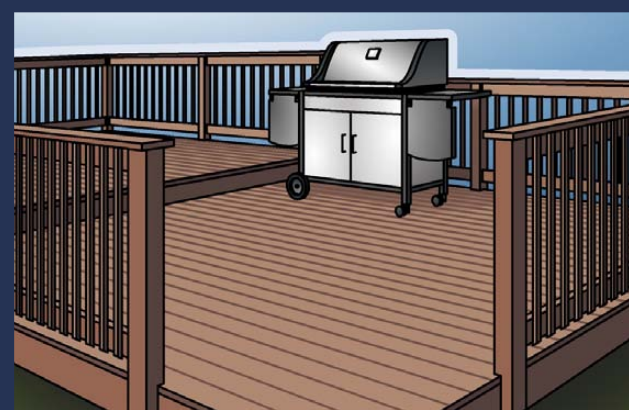
DECKS Use GacoShield without GacoGrip on railings

GACOShield BONDS TO MOST DIMENSIONAL DECKING SURFACES