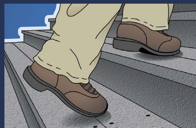
STAIRS When GacoShield is applied to stairs, GacoGrip must be used

ADD GACOGRIP TEXTURE GRANULES FOR A DECORATIVE AND SLIP-RESISTANT FINISH