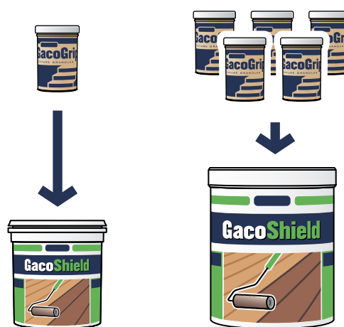
1 GAL. CONTAINER

ADD GACOGRIP TEXTURE GRANULES FOR A DECORATIVE AND SLIP-RESISTANT FINISH